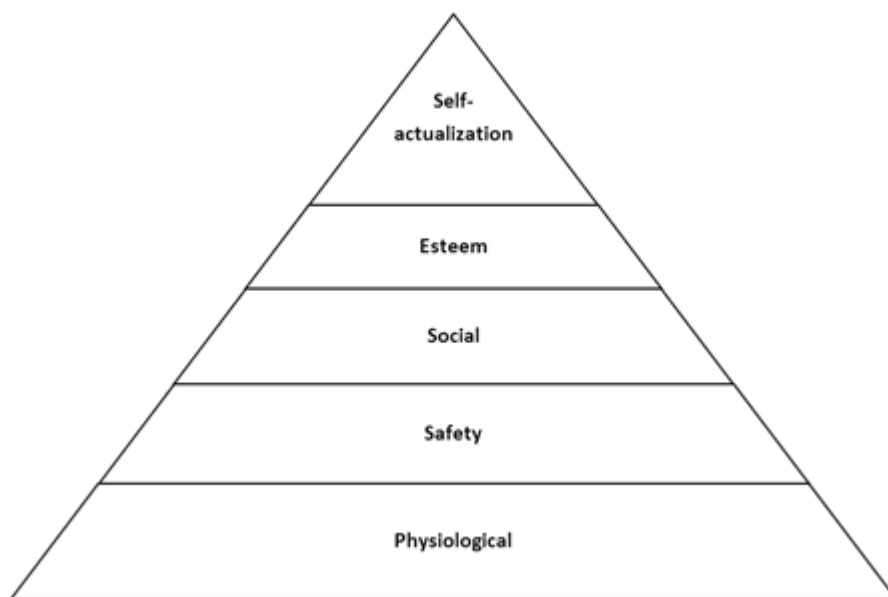
Figure 1: Maslow's hierarchy of needs

From humanistic theories standpoint, one of the most influential researchers in the area of motivation is Abraham Maslow. According to Maslow (1970, cited in Abdulrahman and Hui, 2018), human needs fall into a hierarchy from the most basic psychological needs to needs for self-actualization (Figure 1). His theory of hierarchy of needs proposes that individuals must fulfill their lower-order needs (basic needs such as water and housing, safety, belonging, and esteem) before being motivated to fulfill the higher-order need for self-actualization. The most important point of Maslow's hierarchy of needs is that the motivational strength of an unfulfilled higher-level need depends on the fulfillment of a lower-level need. In the context of teaching, self-actualization can be understood as personal achievement, a key component of teacher motivation.